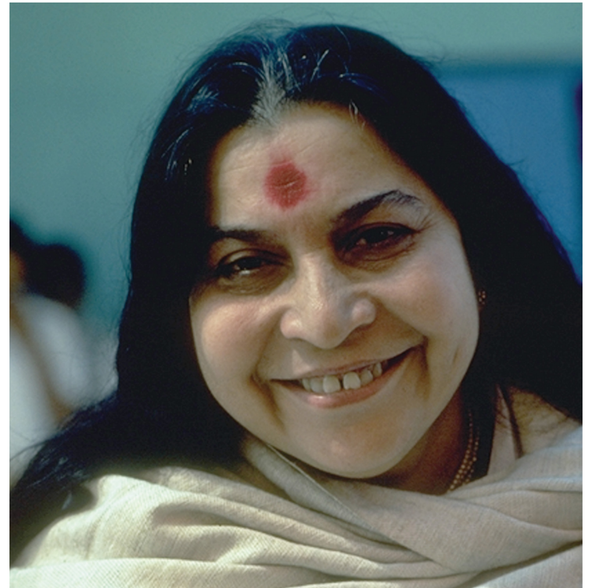
Shri Mataji Nirmala Devi, Founder